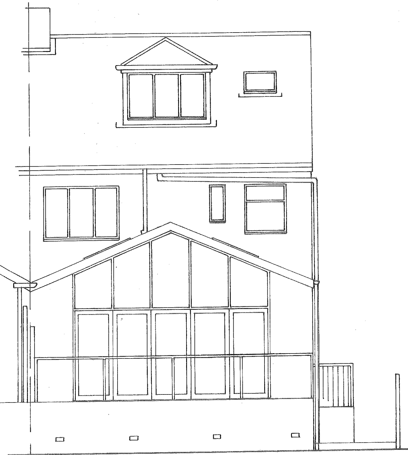
PROPOSED REAR 1:50